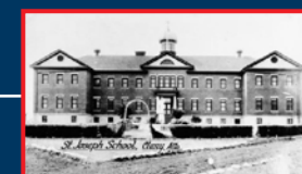
Cluny: Crowfoot (St. Joseph's) Residential School 1900–1968 (68 years)