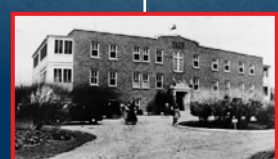
Cardston: St. Mary's (Blood Reserve) Residential School 1898–1988 (90 years)