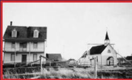
St. Albert: Edmonton Residential School Methodist 1924–1926 United Church 1926–1968 (44 years)