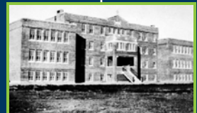
Gleichen: Old Sun (Blackfoot Reserve) Residential School 1886–1971 (85 years)