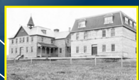
Red Deer: Red Deer Industrial School 1893–1919 (26 years)