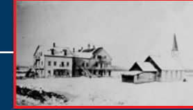
Fort Vermilion: St. Henri's Indian Residential School 1903–1968 (65 years)