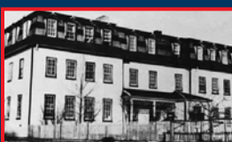
Brocket: St. Cyprian's (Queen Victoria's Jubilee Home) 1890–1961 (71 years)