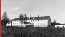
Smoky River/Peace River: St. Augustine Indian Residential School 1900–1907 (7 years)