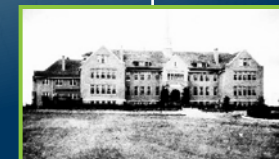
Cardston: St. Paul's (Blood Reserve) Residential School 1893–1975 (82 years)