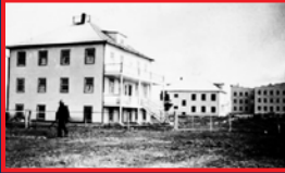
Jossard: St. Bruno's - Jossard Indian Residential School 1913–1969 (56 years)