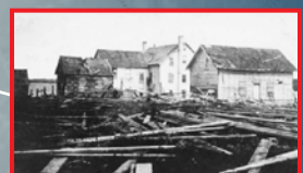
Lac La Biche: Notre Dame des Victoires 1893–1963 (70 years)