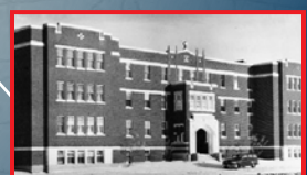
St. Paul: Blue Quills (Formerly Saddle Lake, Sacred Heart, formerly Lac la Biche) Residential School 1931–1970 (39 years)