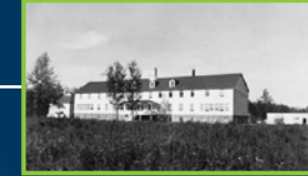
Wabasca: St. John's Wabasca Indian Residential School 1902–1966 (64 years)