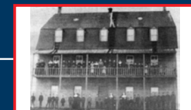
Saddle Lake: Sacred Heart Indian Residential School 1898–1931 (33 years)