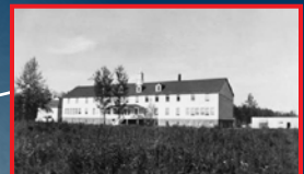
Fort Chipewyan: Holy Angels Residential School 1874–1974 (100 years)