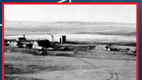
Brocket: Sacred Heart (Peigan Reserve) Residential School 1887–1961 (74 years)