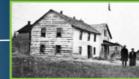
Lesser Slave Lake: St. Peter's Indian Residential School 1895–1932 (37 years)