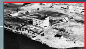
Desmarais-Wabasca: St. Martin's Desmarais Residential School 1902–1973 (71 years)