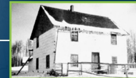
Whitefish Lake: St. Andrew's Indian Residential 1908–1950 (42 years)