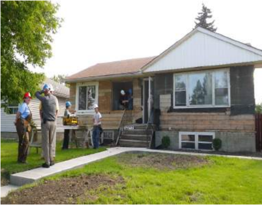
A unit under renovation for the Habitat Program.