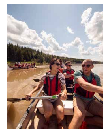
On the Cover: Guests of Métis Crossing's Paddle into the Past experience make their way down the North Saskatchewan River.