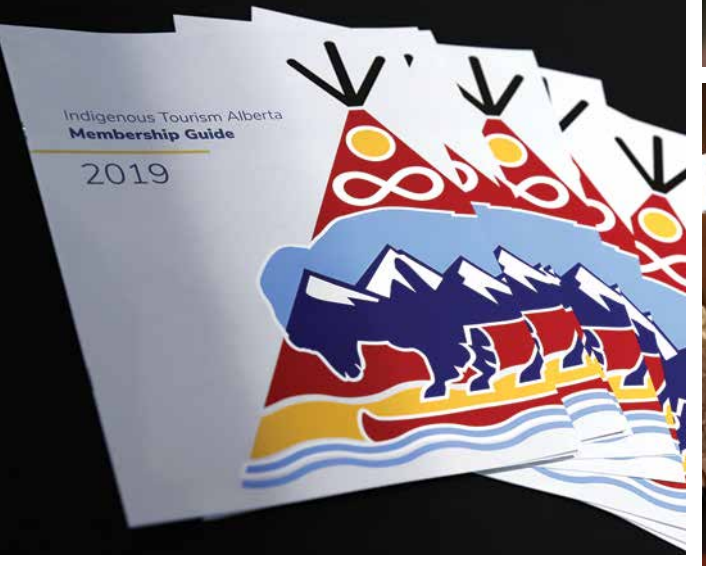
To learn more about other Indigenous Tourism experiences in Alberta, please visit: indigenoustourismalberta.ca