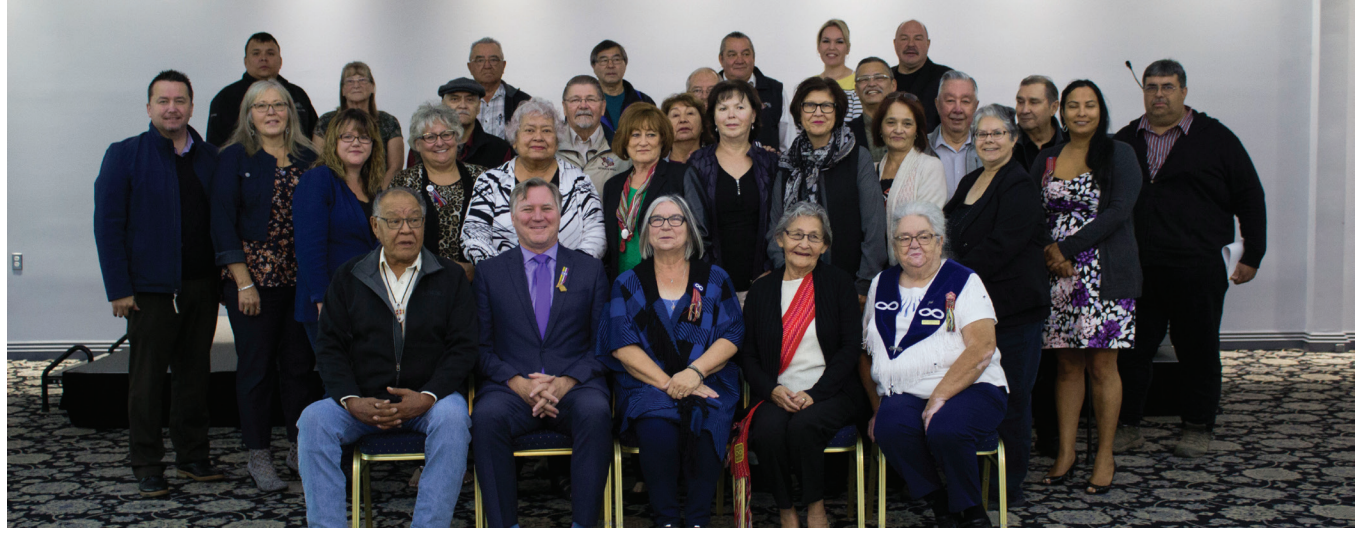
Métis Nation of Alberta representitives meeting with the Government of Alberta to discuss an Alberta Métis Consultation Policy

Key highlights from meeting with Métis Nation of Alberta and Minister of Indigenous Relations