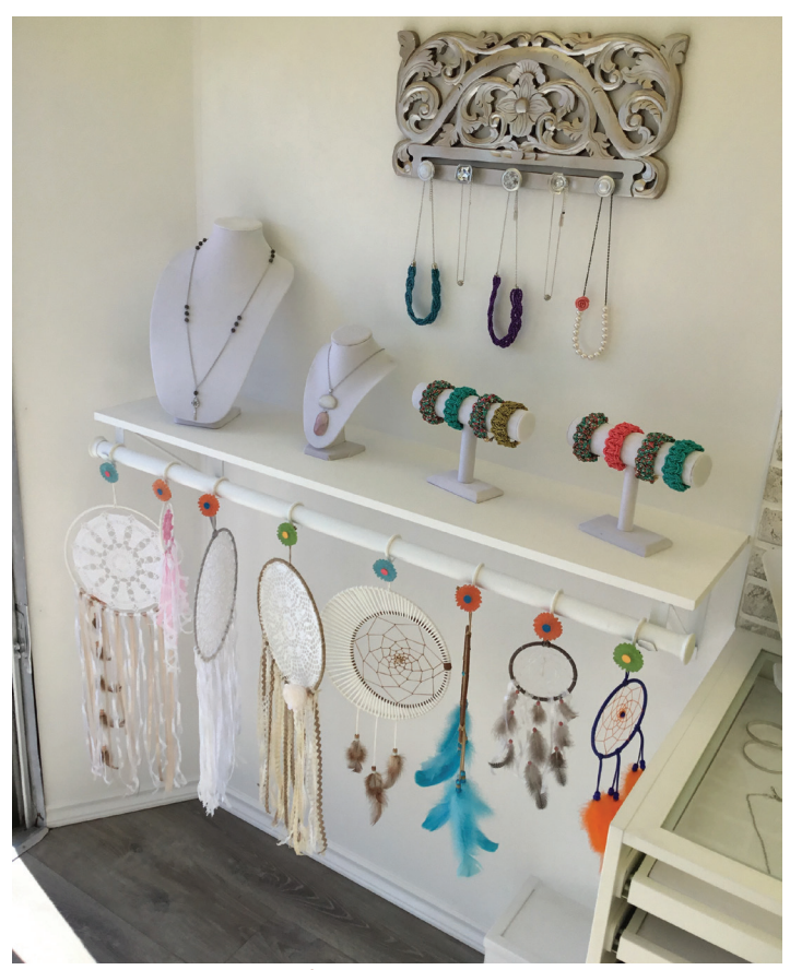
Out of the Blue Mobile Boutique