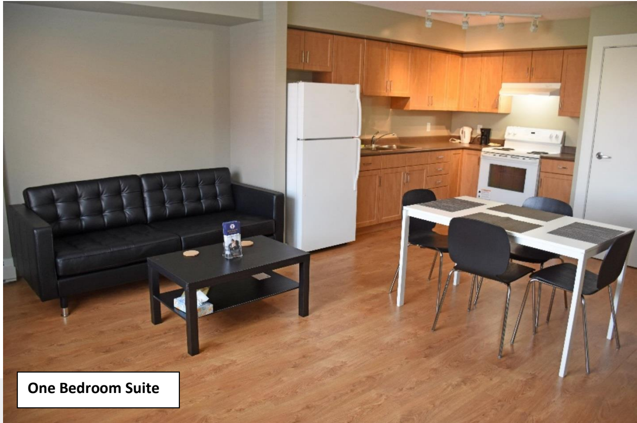
One Bedroom Suite