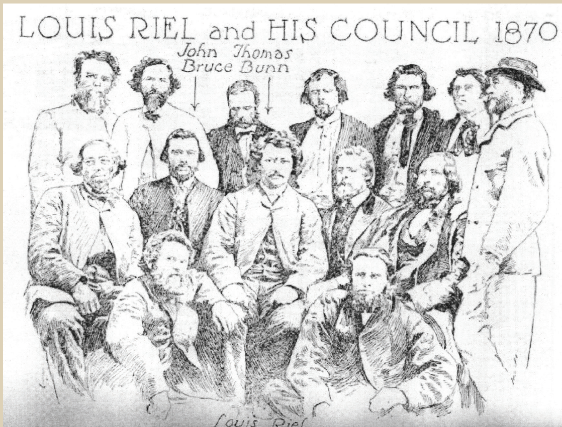
Louis Riel's Council 1870

"My quick surrender has contributed, I think, to a greater hope for the Metis to have peace, and has done them good, I presume... I humbly ask not to be treated as a murderer and not to be ironed before the jury have pronounced. And I am confident they will find me not guilty."