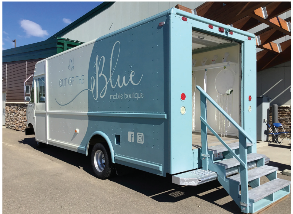
Out of the Blue Mobile Boutique

For more information about Out of the Blue Mobile Boutique visit: www.facebook.com/outofthebluemobile/