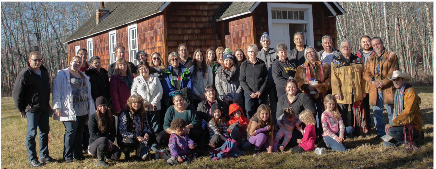
Louis Riel Commemorative Walk 2016