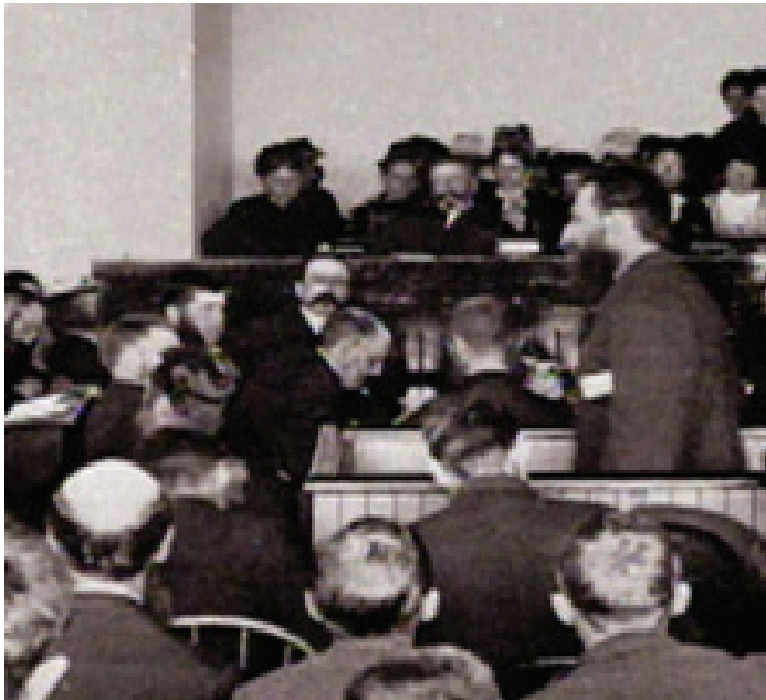
Trial of Louis Riel, 1885