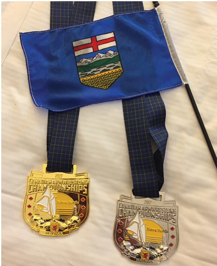
2017 Armwrestling Championship Gold & Silver medals