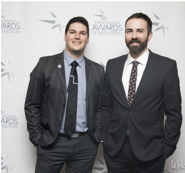
Carvel Electric, as a nominee last year for the Eagle Feather Award, part of the Alberta Business Awards of Distinction ( www.abbusinessawards.com )