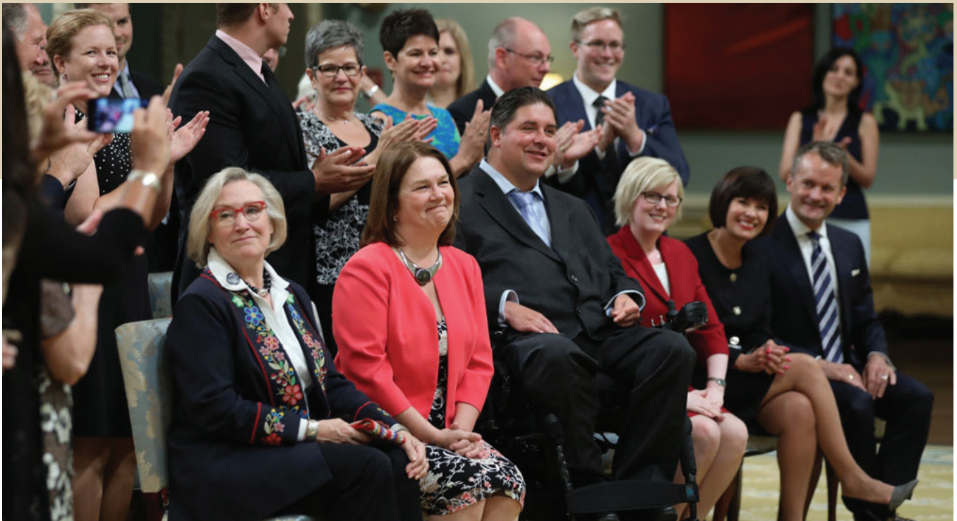
Carolyn Bennett, Jane Philpott, Kent Hehr, Carla Qualtrough, Ginette Petitpas Taylor, and Seamus O'Regan

The Métis Nation of Alberta (MNA) is optimistic about the changes as they are modelled on recommendations from the 1996 Royal Commission on Indigenous Peoples, which included a chapter on the Métis. It is also important to note, although this recent announcement is a positive start, much more work is still needed to build a successful nation-to-nation, government-to-government relationship between the Métis and the Canadian Government.