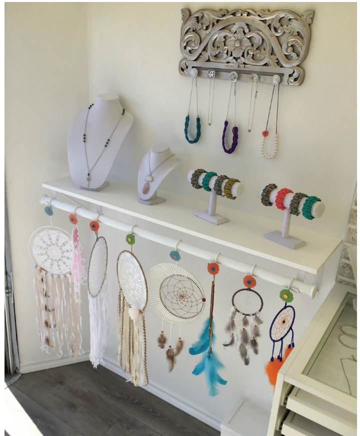
Out of the Blue Mobile Boutique