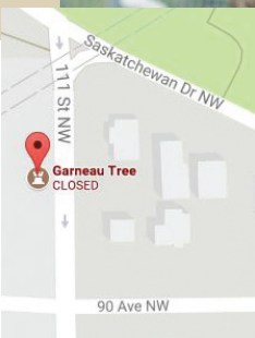
The Garneau Tree