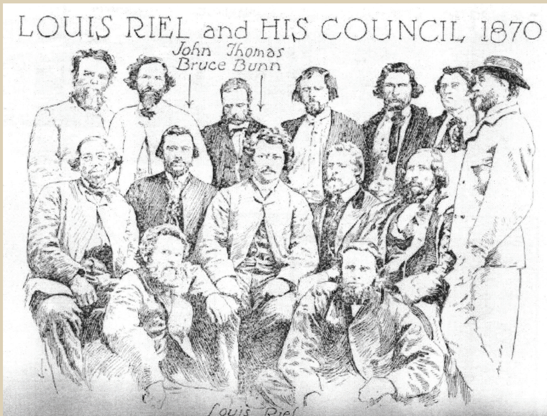
Louis Riel's Council 1870

"My quick surrender has contributed, I think, to a greater hope for the Metis to have peace, and has done them good, I presume... I humbly ask not to be treated as a murderer and not to be ironed before the jury have pronounced. And I am confident they will find me not guilty."