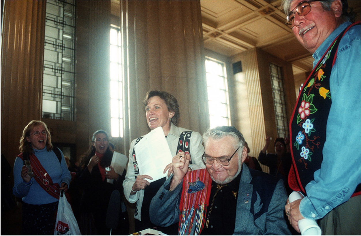
Powley Supreme Court Decision