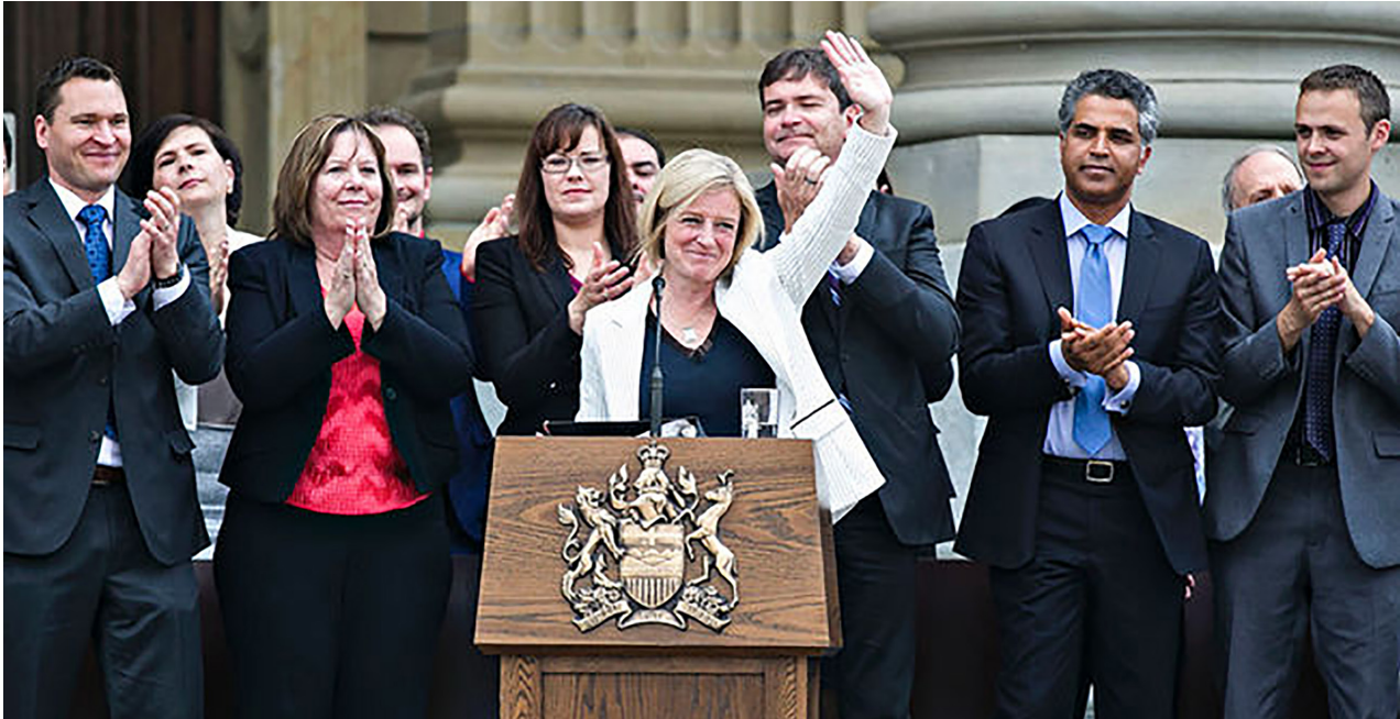
The Swearing In ceremony for newly elected Alberta Premier, Rachel Notley

Since the historic election of a new NDP government in May 2015, the MNA's leadership has met with many members of the new government, including, several calls and meetings with the Minister for Aboriginal Affairs who is also the Minister of Justice and Attorney General. All of these meetings have been extremely positive and there appears to be a real willingness to take "fresh approaches" on dealing with Métis rights.